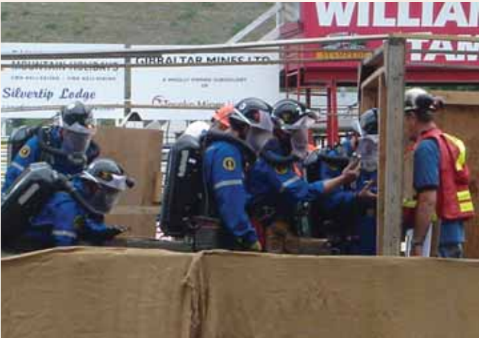
52nd Annual BC Provincial Mine Rescue Competition at Williams Lake

British Columbia's booming mining industry is also among the safest of heavy industries. This is due in part to the skill and dedication of mine rescue workers. All BC mines are required to provide emergency response capabilities under the Health, Safety and Reclamation Code. These rescue teams help make BC's mining industry a world-wide model for health and safety practices..