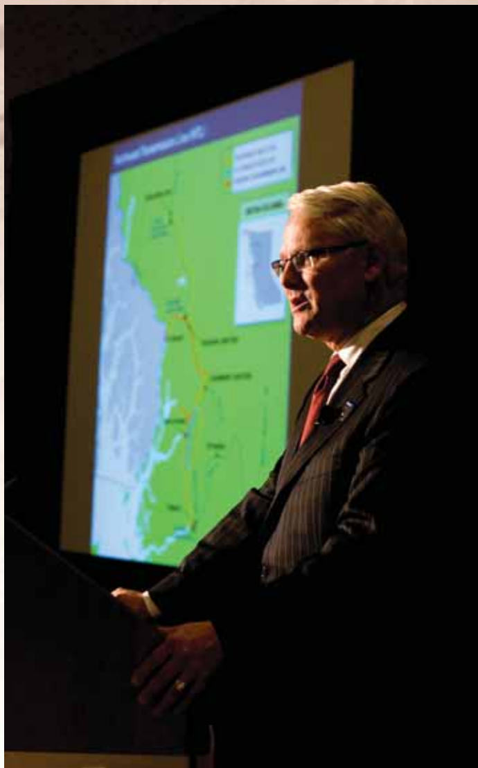
BC Premier Gordon Campbell announces Northwest Transmission Line at the Asia Pacific Forum 2007

On October 1st at the Inaugural Asia Pacific Forum on mining and minerals, BC Premier Gordon Campbell joined representatives from industry including the MABC, to announce the Government has asked the British Columbia Transmission Corp. (BCTC) to proceed with the $400-million Northwest Transmission Line (NTL) in northern B.C., “opening the door to investment and community development.”