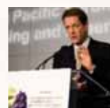
Robert Friedland, Ivahoë Mines gives keynote address at Asia Pacific Forum 2007